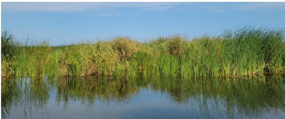
Figure 5. Native Phragmites and cattails on the Coldwater River. Sample 6 of DNA collection.