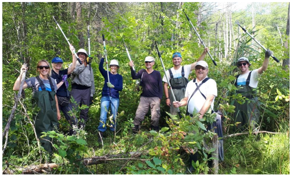
Figure 8. GBF and MTM Community cut at the North Beaver Pond (aka Quarry Rd Pond).