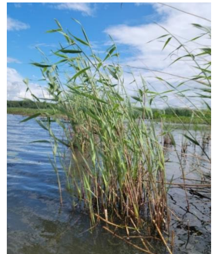
Figure 2. Native Phragmites in Matchedash Bay.

Invasive Phragmites can be identified by their connecting root system of hollow rhizomes, beige stems and tall green stalks with alternating leaves. The stalks, if well-established, can grow up to 15 ft tall. Native Phragmites looks quite similar but does not grow as tall or dense and will co-exist amongst other native species. In late August and into the fall, invasive phragmites begin to develop large purple/reddish seed heads, unlike the native Phragmites that develop seeds earlier in the season. After seeds disperse in the fall, the stalks die and remain standing throughout the winter strong and dry posing as a fire hazard. Majority of native plants will fall under the weight of snow, break down, contribute nutrients back to the soil and allow space for new vegetation to grow come Spring. The remains of dried out stalks of invasive Phragmites prevent new growth of native plants in the Spring. During the summer, one can identify a stand of invasive phragmites by the presence of leftover standing stalks and seeds from years previous. Phragmites Identification Tips | Georgian Bay Forever