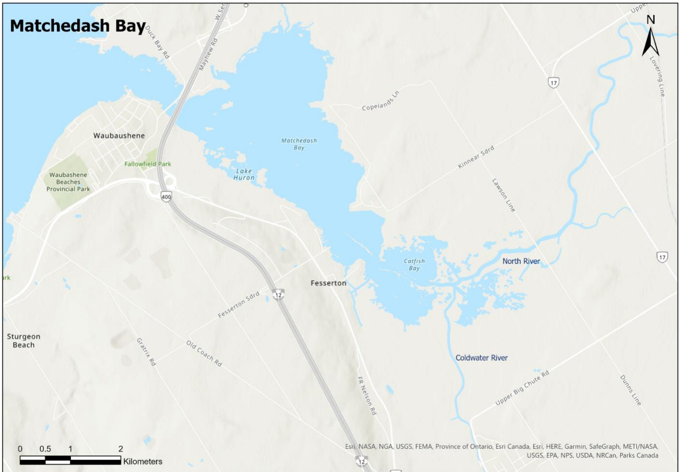
Figure 1. Map of Matchedash Bay, located in the Township of Severn.