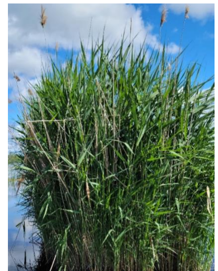
Figure 3. Invasive Phragmites in Matchedash Bay.