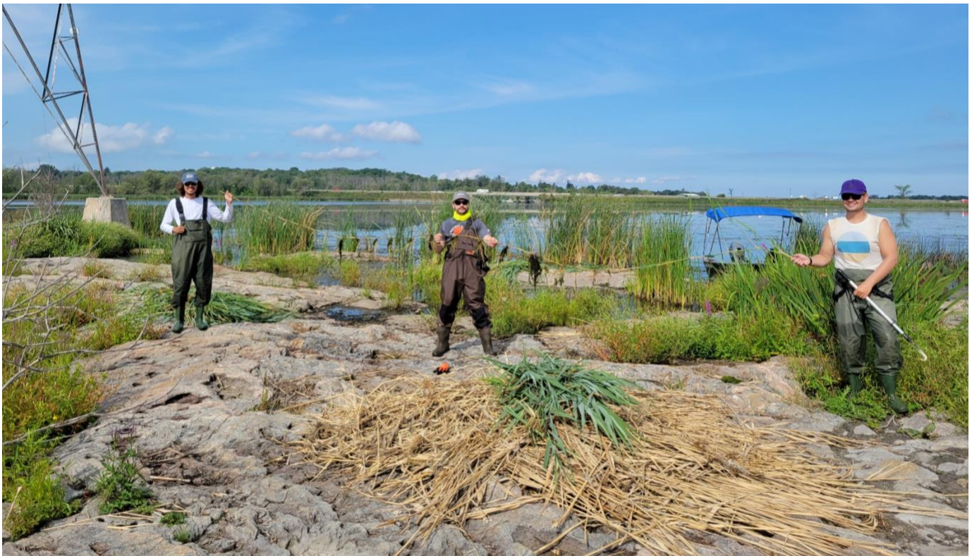
Figure 6. GBF and SSEA holding an extremely long Phragmites rhizome.

As mentioned in the Introduction to Phragmites section of this report, there was a lot of discrepancy when it came to identifying the native vs. invasive Phragmites . Because of this, many of the stands along the Coldwater River and North River were not treated. Fortunately, majority of these stands turned out to be native.