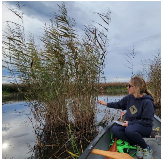
Figure 4. Collecting DNA Sample 5 along the North River.

Along the North River and Coldwater there were many sites of uncertainty found. The Phragmites in these locations were large, dense and tall like the invasive but also displayed a lighter green/yellow colour, red stalks and sparse seed heads similar to the native strain. In discussions with SSEA and MTM Conservation Association, there was still uncertainty in the identification of these sites. In the fall, GBF’s Project Coordinator collected 7 samples and sent them to the Wendell Lab at Oakland University for analysis ( https://doi.org/10.1016/j.jglr.2021.08.002 ).