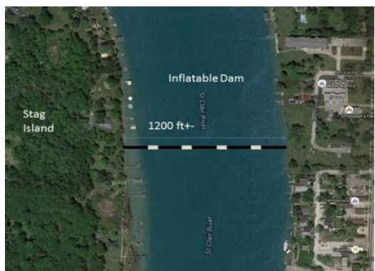
Inflatable Dam - Stag Island, St. Clair River

terms of both lake level control capability and power generation capacity. This emerging technology has been applied in multiple locations in the United States and overseas. Primary applications to date are for “clean” power generation, but modeling exercises have also demonstrated applicability for water level control purposes.