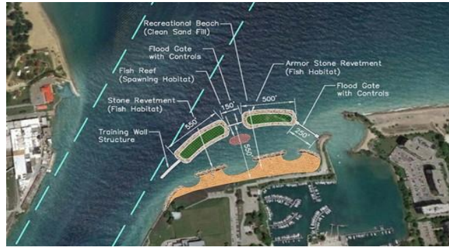
Park Fill and Control Gate System- Mouth of St. Clair River

Constructing a Park Fill and Control Gate System at the mouth of the St. Clair River would raise upstream water levels by as much as 19 cm (7.5 in). This alternative has additional benefits, as it entails the construction of two islands that also provide upland habitat, fish spawning structure and water-based recreational opportunities. Control gates are readily adjustable based upon water level variations.